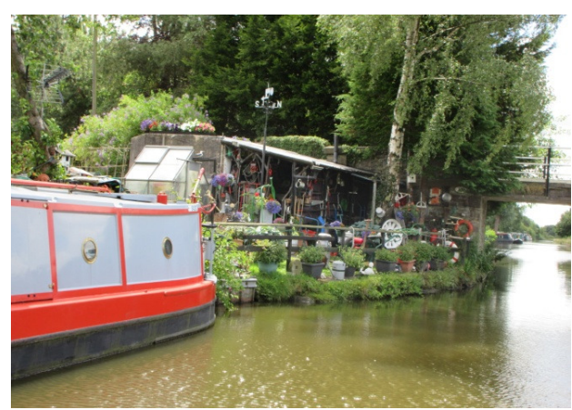
View of an interesting canal side garden

the fish and chip shop's website that Jim had then accessed, ended up causing considerable consternation for those trying to organise the finances!